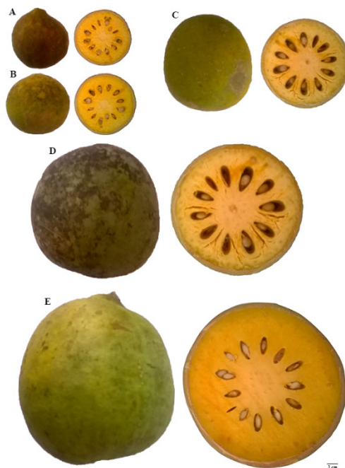
Figure 1. Variation of the fruit morphology in five bael accessions. The fruit and cross section of the fruit are shown side by side. A: Beheth Beli , B: Paragammana , C: Mawanella , D: Rambukkana , E: Polonnaruwa Supun .

Within a column, means denoted with same letters are not significantly different at P = 0.05 .